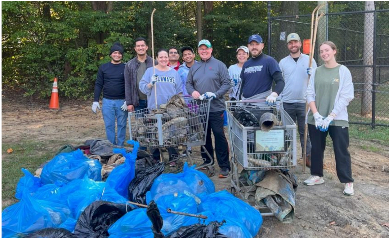
Volunteers of the Marriot Fairview Park