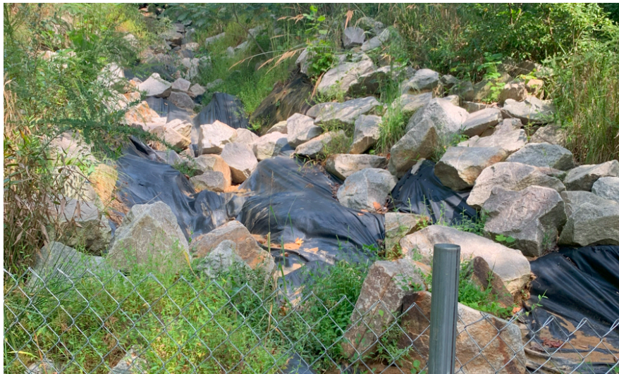
Condition of the slope in September, 2024

Asheville and other locations are hurting right now from the remnants of hurricanes. Our region is overdue for our next taste of the same. When it comes (or even a heavy thunderstorm), let's hope this gully is not still left exposed to finally collapse catastrophically.