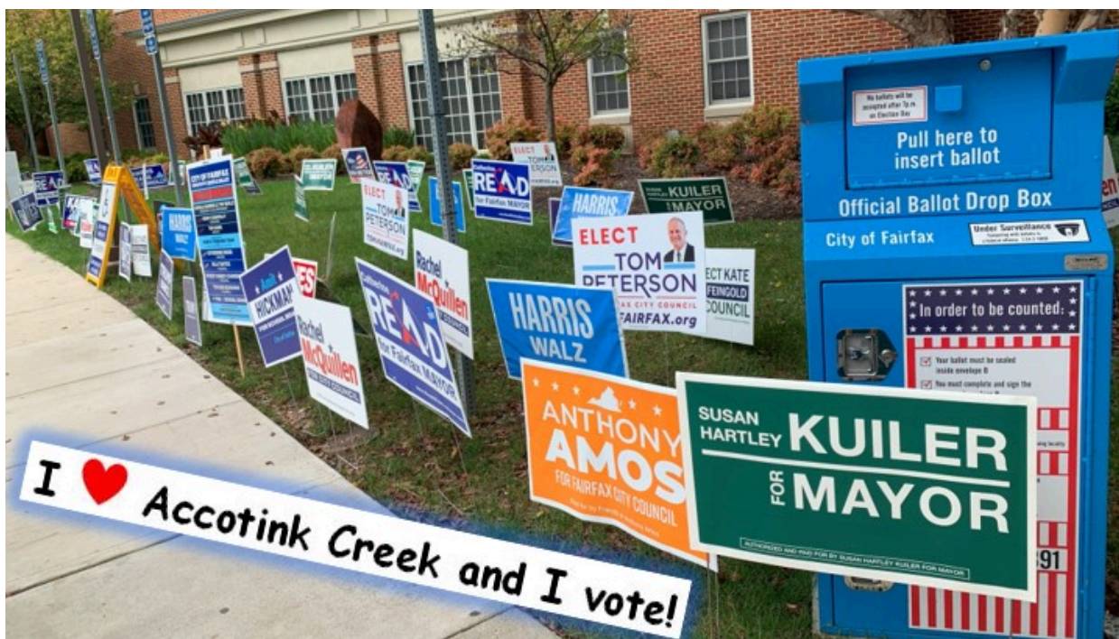
Early Voting is underway at Fairfax City Hall

We don't need to be residents of the city to assist as individuals handing out sample ballots to voters at City Hall. It is a daily activity through election day, and is usually busiest at lunchtime and in the late afternoon. This would only be something to be done as individuals, since FACC as a 501(c)3 cannot support candidates. Nor can we suggest here which of the two sample ballots you might wish to help with.